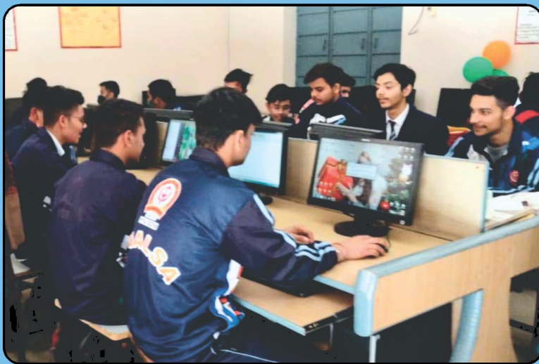
“Transforming students activity into creativity”