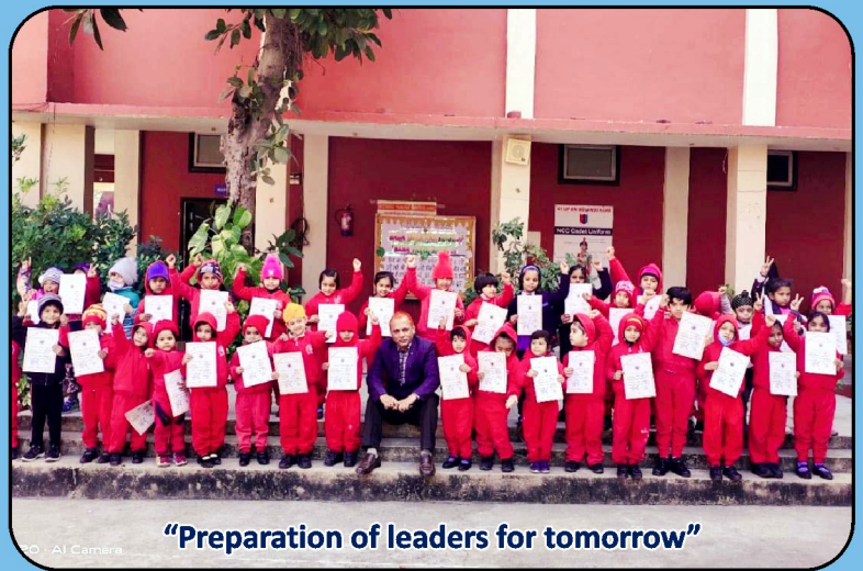
“Preparation of leaders for tomorrow”

Khalsa Mont. Sr. Sec. School aims to be an institution of excellence, dedicated to empowering students with local and global perspective to develop values, principles and ethics that are respected, admired & accepted. It also encourages students to explore questions, seek solutions and express themselves confidently, thus develop skills for the future.