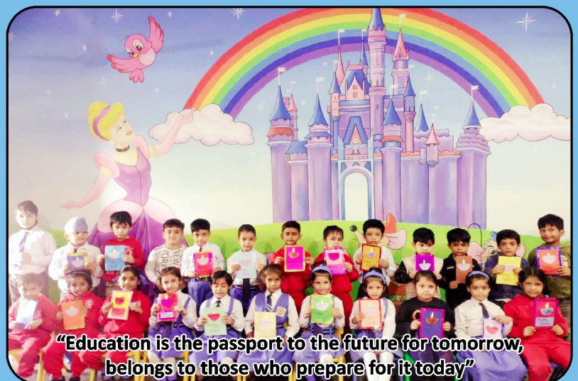
“Education is the passport to the future for tomorrow, belongs to those who prepare for it today”

Our curriculum brings to the learners the best of both the worlds. It unites the educational approach in India and in the west, to form a programme of study that ensures a sense of identity, spiritualism, scientific understanding of their individual needs.